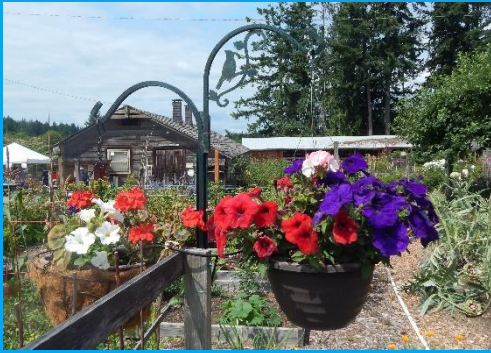
Gardens were in full bloom for the visitors at the Salmon and Rib Bake