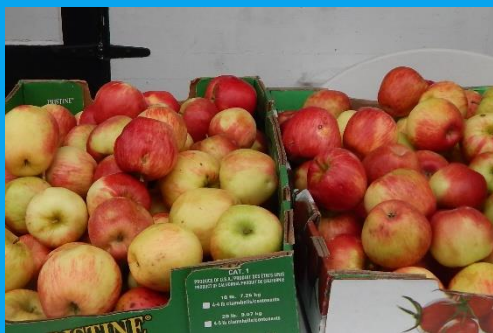
Lots of apples for the Apple Squeeze this year! 9/21/2019