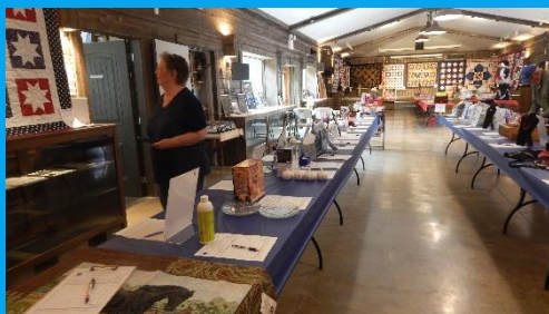
Setting up this year's silent auction at the Salmon and Rib Bake