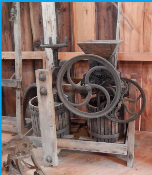
One of the new displays in the historic barn