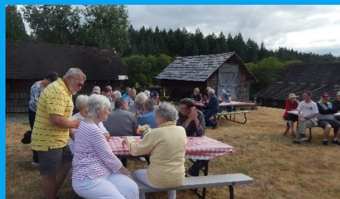
Volunteers check in for food safety training the evening before the Salmon and Rib Bake