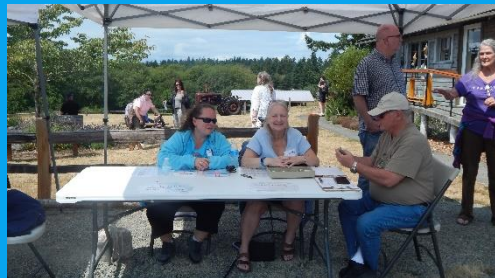
Selling tickets at the Salmon and Rib Bake, a busy team!