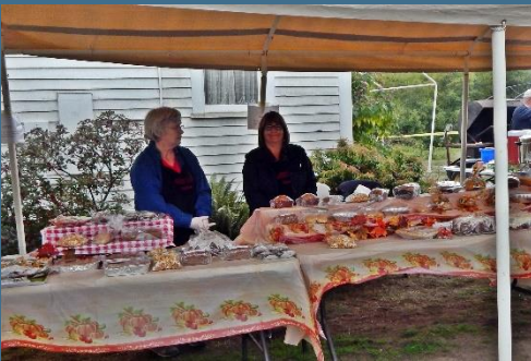
The bake sale started out with full tables!