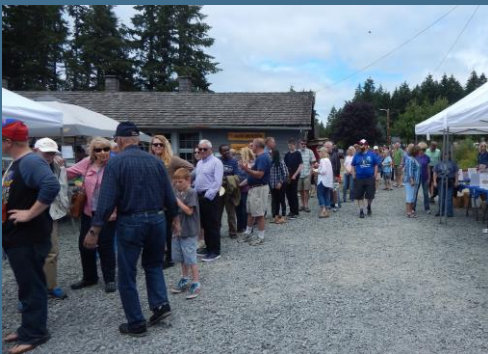
Waiting in line for the salmon! Good time to catch up with your neighbors