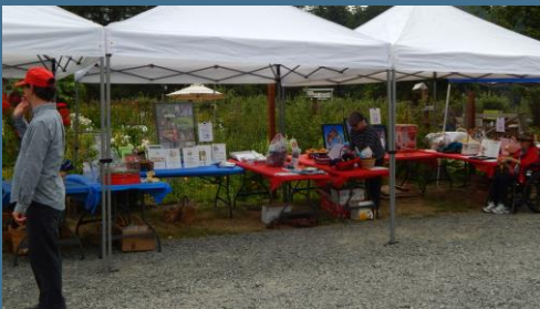
Setting up the silent auction