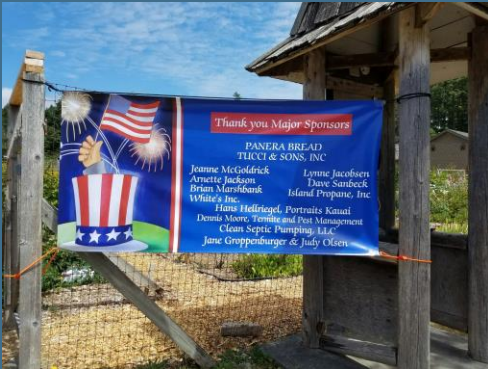
Thanks to our sponsors for the Salmon Bake!